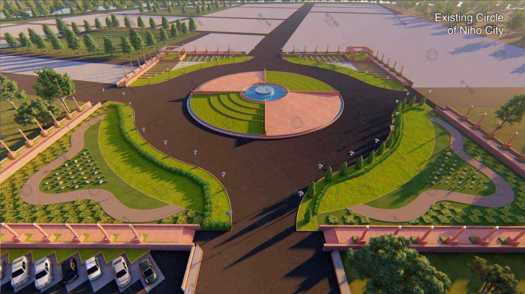
Existing Circle of Niho City