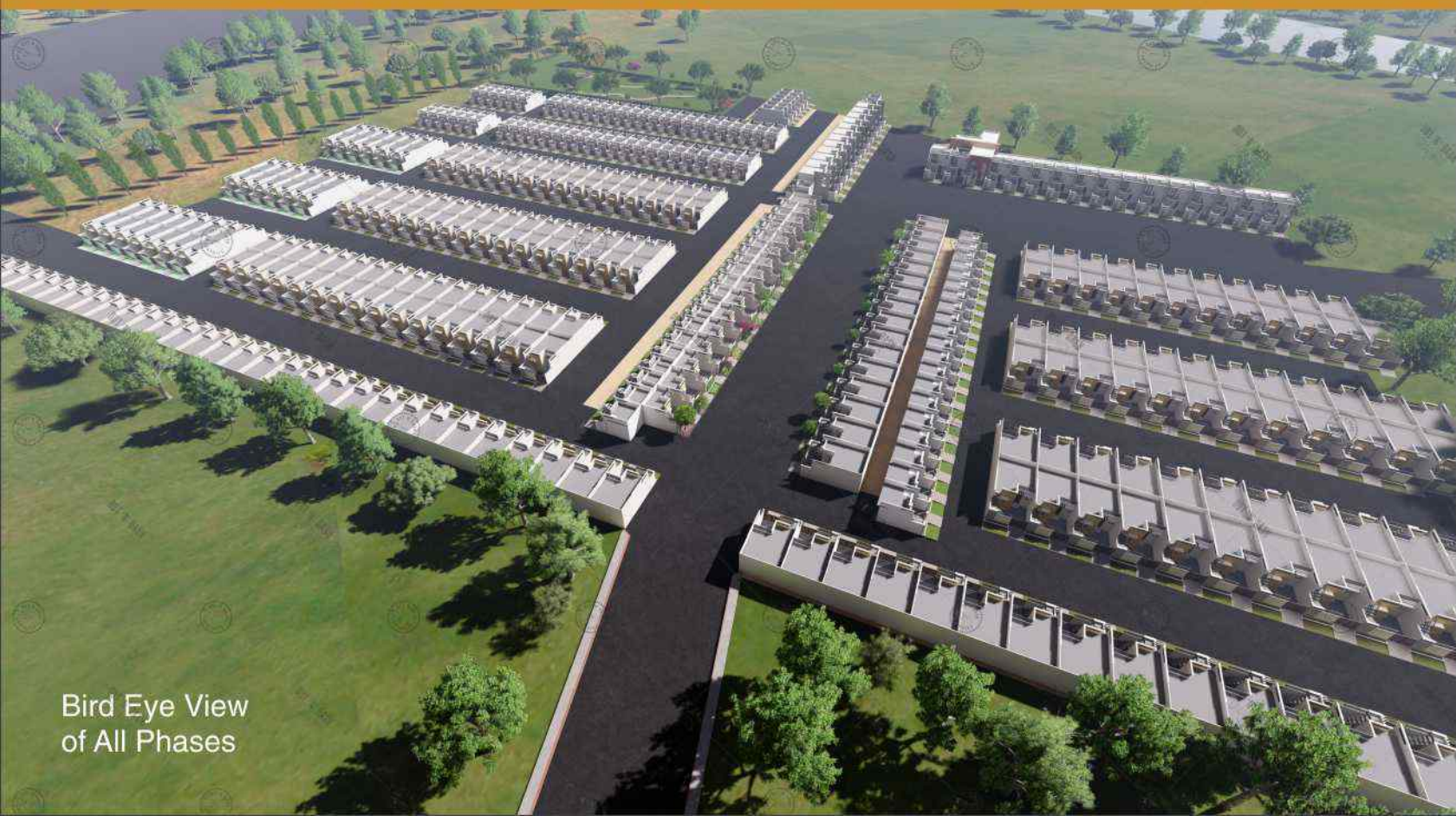
Bird Eye View of All Phases

Unlock the key to happiness, own an independent villa at CITY HOME. An absolute combination of lavish accommodations and out-and-out satisfaction with abounding amenities at affordable rates. A well-functional clubhouse and beautifully landscaped garden will see you in the spirit of luxurious living.